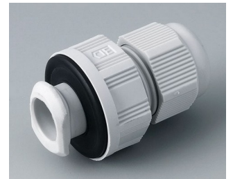
C2316717 Quick fix cable gland, M16 PA light grey RAL 7035 IP 68