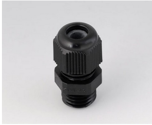
C2312419 Cable gland M12x1.5 PA black RAL 9005 IP 68