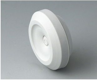
C2320147 Cable grommet TPE light grey RAL 7035