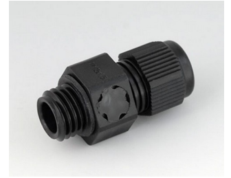
C2312919 Cable gland M12x1.5, pressure compensation PA black RAL 9005 IP 68