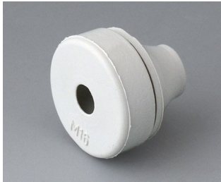
C2316137 Cable grommet EPDM light grey RAL 7035 IP 67