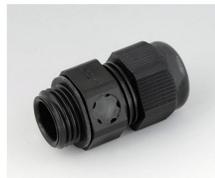
C2316919 Cable gland M16x1.5, pressure compensation PA black RAL 9005 IP 68