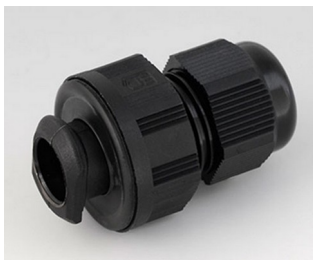
C2316719 Quick fix cable gland, M16 PA black RAL 9005 IP 68