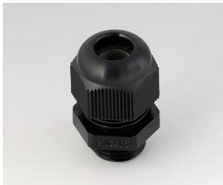
C2316419 Cable gland M16x1.5 PA black RAL 9005 IP 68