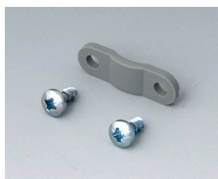
A9199005 Strain relief PA 6 volcano