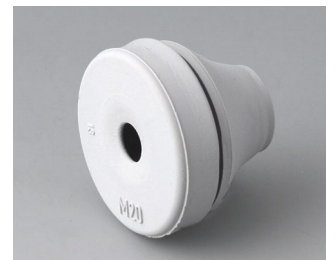
C2320137 Cable grommet EPDM light grey RAL 7035 IP 67