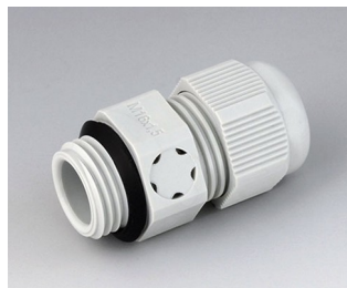
C2316917 Cable gland M16x1.5, pressure compensation PA light grey RAL 7035 IP 68