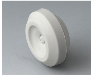
C2316147 Cable grommet TPE light grey RAL 7035 IP 67