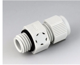
C2312917 Cable gland M12x1.5, pressure compensation PA light grey RAL 7035 IP 68