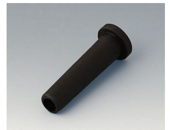
C2353849 Flexible cable grommet Ø 5,3 black