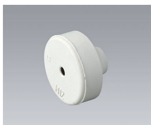
C2312137 Cable grommet EPDM light grey RAL 7035