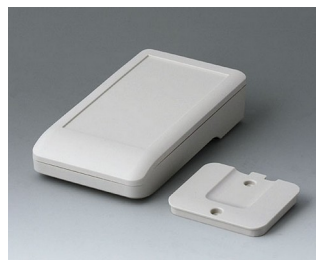
A9005217 DATEC-COMPACT S ASA+PC (UL 94 V-0) off-white RAL 9002 136x74x32mm IP 41