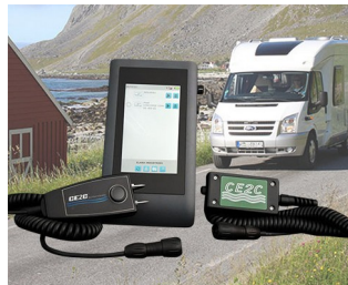
System for leak detection in leisure vehicles