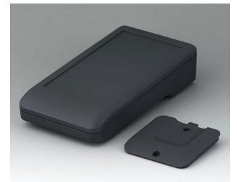
A9006218 DATEC-COMPACT M ASA+PC (UL 94 V-0) lava 172x92x39mm IP 41