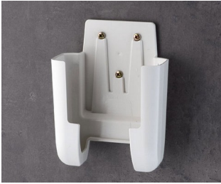
A9107627 Holder L ASA+PC (UL 94 V-0) off-white RAL 9002