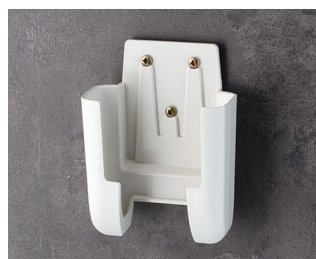
A9106627 Holder M ASA+PC (UL 94 V-0) off-white RAL 9002