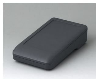
A9005118 DATEC-COMPACT S ASA+PC (UL 94 V-0) lava 136x74x32mm IP 41