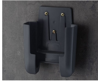
A9107628 Holder L ASA+PC (UL 94 V-0) lava