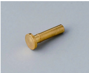
A9193030 Contact pin gold-plated