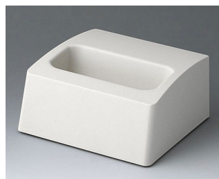
A9106507 Station M ASA+PC (UL 94 V-0) off-white RAL 9002