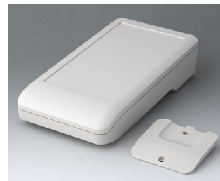
A9007217 DATEC-COMPACT L ASA+PC (UL 94 V-0) off-white RAL 9002 206x110x47mm IP 41