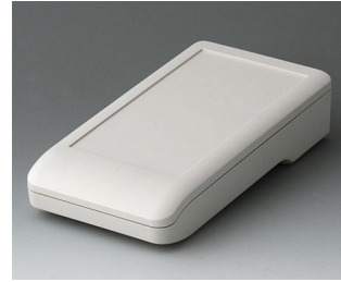
A9006117 DATEC-COMPACT M ASA+PC (UL 94 V-0) off-white RAL 9002 172x92x39mm IP 41