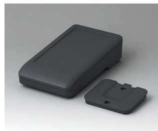
A9005218 DATEC-COMPACT S ASA+PC (UL 94 V-0) lava 136x74x32mm IP 41