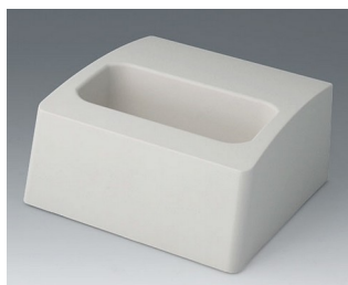
A9107507 Station L ASA+PC (UL 94 V-0) off-white RAL 9002