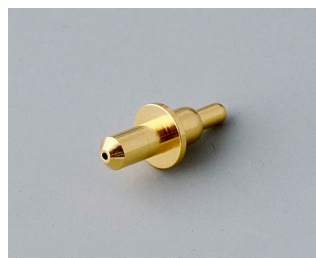
A9193031 Spring contact gold-plated