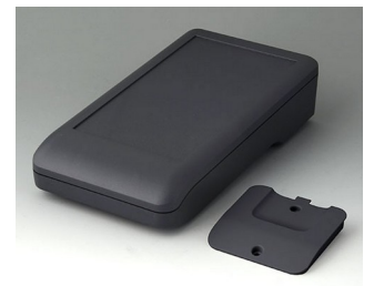
A9007218 DATEC-COMPACT L ASA+PC (UL 94 V-0) lava 206x110x47mm IP 41