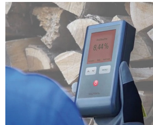
Wood moisture measuring device