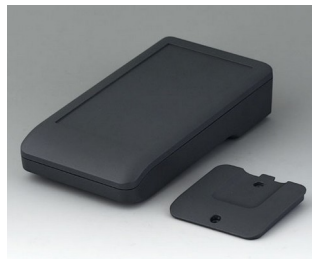
A9006208 DATEC-COMPACT M ASA+PC (UL 94 V-0) lava 172x92x39mm IP 65