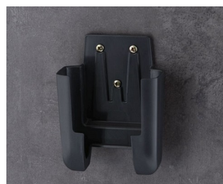
A9106628 Holder M ASA+PC (UL 94 V-0) lava