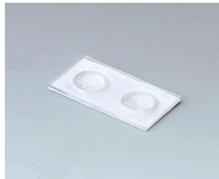
A9207150 Anti-slide feet 6.5 x 2 mm transparent