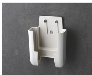
A9105627 Holder S ASA+PC (UL 94 V-0) off-white RAL 9002