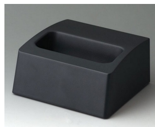
A9106508 Station M ASA+PC (UL 94 V-0) lava