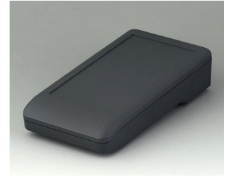
A9006118 DATEC-COMPACT M ASA+PC (UL 94 V-0) lava 172x92x39mm IP 41