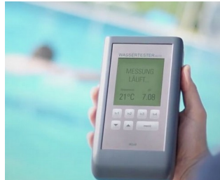
Electronic pool tester