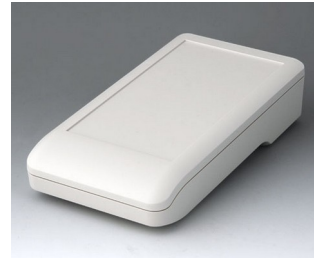
A9007117 DATEC-COMPACT L ASA+PC (UL 94 V-0) off-white RAL 9002 206x110x47mm IP 41