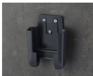
A9105628 Holder S ASA+PC (UL 94 V-0) lava