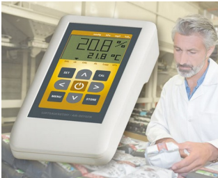
Atmospheric oxygen measuring unit