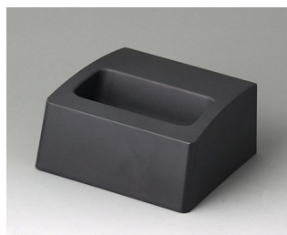
A9105508 Station S ASA+PC (UL 94 V-0) lava