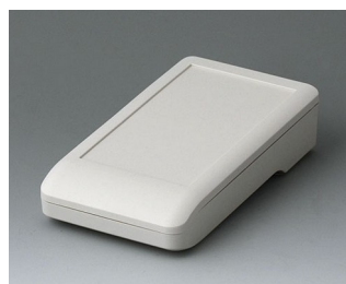
A9005117 DATEC-COMPACT S ASA+PC (UL 94 V-0) off-white RAL 9002 136x74x32mm IP 41