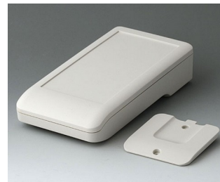
A9006217 DATEC-COMPACT M ASA+PC (UL 94 V-0) off-white RAL 9002 172x92x39mm IP 41