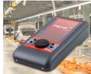
Mobile diagnostic device for CAN and CAN FD buses