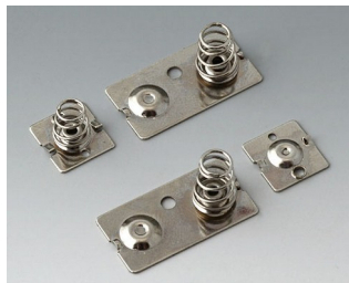
A9190023 Set of battery clips, 3 x AA Steel nickel-plated