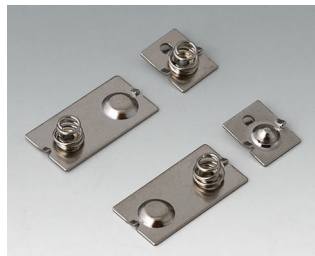
A9190024 Set of battery clips, 3 x AAA Steel nickel-plated