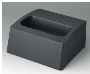
A9107508 Station L ASA+PC (UL 94 V-0) lava