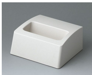
A9105507 Station S ASA+PC (UL 94 V-0) off-white RAL 9002