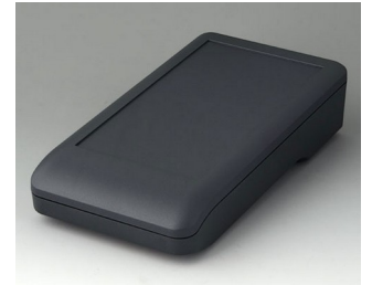
A9007118 DATEC-COMPACT L ASA+PC (UL 94 V-0) lava 206x110x47mm IP 41