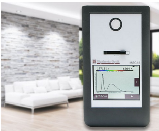
Spectral light meter