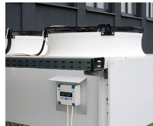
Heating/air conditioning/ventilation control