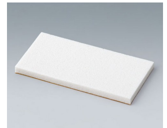
A9250251 Battery spacer PE foam 50x25x3mm