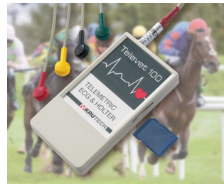
Telemetric ECG system for veterinary medicine