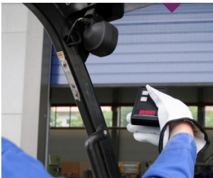
IR remote control for harsh environments