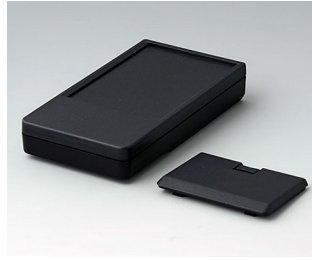
A9072129 DATEC-POCKET-BOX L ABS (UL 94 HB) black RAL 9005 120x65x22mm IP 41