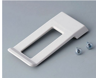
A9172107 Belt/Pocket clip ABS (UL 94 HB) off-white RAL 9002 62x30mm