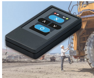
Radio transmitter for machines