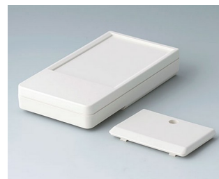
A9072117 DATEC-POCKET-BOX L ABS (UL 94 HB) off-white RAL 9002 120x65x22mm IP 54