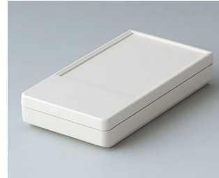
A9070117 DATEC-POCKET-BOX S ABS (UL 94 HB) off-white RAL 9002 85x46x16mm IP 54