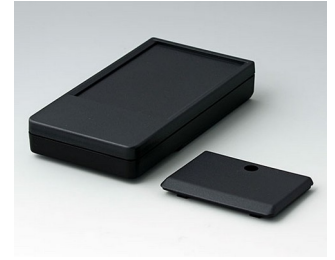
A9072219 DATEC-POCKET-BOX L PMMA (IR) (UL 94 HB) black RAL 9005 120x65x22mm IP 54