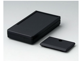
A9071219 DATEC-POCKET-BOX M PMMA (IR) (UL 94 HB) black RAL 9005 105x58x18.5mm IP 54