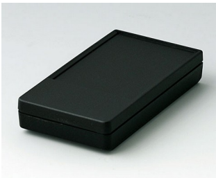
A9070209 DATEC-POCKET-BOX S PMMA (IR) (UL 94 HB) black RAL 9005 85x46x16mm IP 41