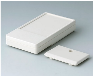
A9071117 DATEC-POCKET-BOX M ABS (UL 94 HB) off-white RAL 9002 105x58x18.5mm IP 54