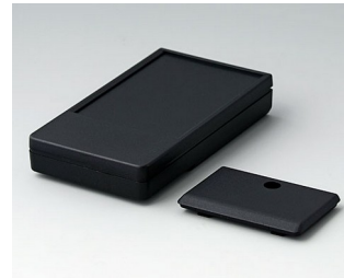
A9071209 DATEC-POCKET-BOX M PMMA (IR) (UL 94 HB) black RAL 9005 105x58x18.5mm IP 41