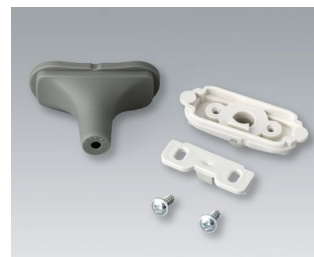
B2911308 Cable gland kit, 3.4 - 4.2 TPE volcano