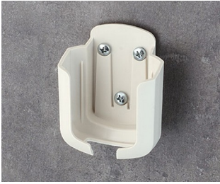
B2931507 Holder M ASA+PC (UL 94 V-0) off-white RAL 9002