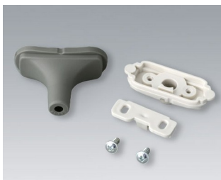
B2911318 Cable gland kit, 4.2 - 5.0 TPE volcano