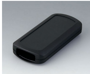
B2833109 CONNECT M ASA+PC (UL 94 V-0) black RAL 9005 116x54x22mm