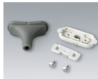
B2911328 Cable gland kit, 5.0 - 5.9 TPE volcano