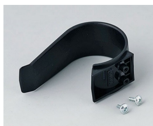
A9167029 Holding clamp PA 6 (UL 94 HB) black RAL 9005