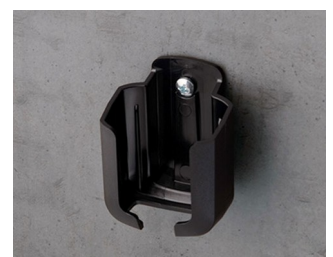
B2921509 Holder S ASA+PC (UL 94 V-0) black RAL 9005