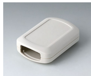
B2832107 CONNECT M ASA+PC (UL 94 V-0) off-white RAL 9002 76x54x22mm