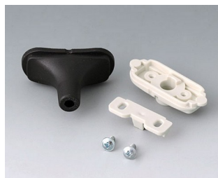
B2911319 Cable gland kit, 4.2 - 5.0 TPE black RAL 9005