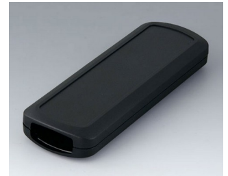
B2834109 CONNECT M ASA+PC (UL 94 V-0) black RAL 9005 156x54x22mm