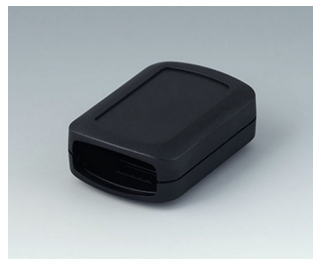
B2822109 CONNECT S ASA+PC (UL 94 V-0) black RAL 9005 60x42x22mm