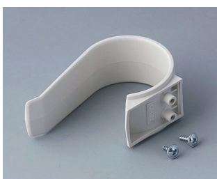
A9167027 Holding clamp PA 6 (UL 94 HB) off-white RAL 9002