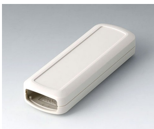
B2824107 CONNECT S ASA+PC (UL 94 V-0) off-white RAL 9002 120x42x22mm