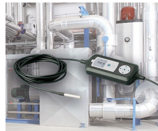
Process monitoring with temperature sensor