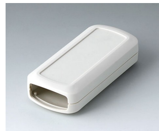
B2823107 CONNECT S ASA+PC (UL 94 V-0) off-white RAL 9002 90x42x22mm