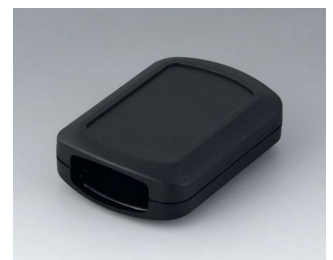
B2832109 CONNECT M ASA+PC (UL 94 V-0) black RAL 9005 76x54x22mm