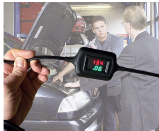
Voltage and current display during trickle charging