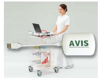
Receiver and data transfer for EMR