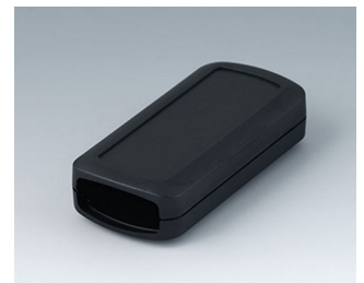
B2823109 CONNECT S ASA+PC (UL 94 V-0) black RAL 9005 90x42x22mm