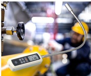
Gas leak detector