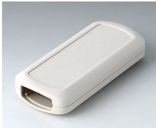
B2833107 CONNECT M ASA+PC (UL 94 V-0) off-white RAL 9002 116x54x22mm