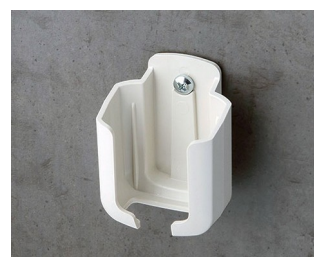
B2921507 Holder S ASA+PC (UL 94 V-0) off-white RAL 9002