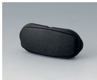
B2811209 End part ASA+PC (UL 94 V-0) black RAL 9005