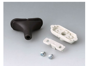
B2911329 Cable gland kit, 5.0 - 5.9 TPE black RAL 9005