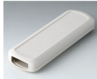
B2834107 CONNECT M ASA+PC (UL 94 V-0) off-white RAL 9002 156x54x22mm