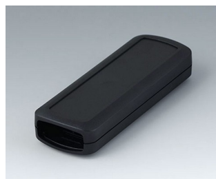
B2824109 CONNECT S ASA+PC (UL 94 V-0) black RAL 9005 120x42x22mm