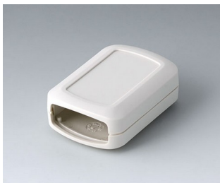
B2822107 CONNECT S ASA+PC (UL 94 V-0) off-white RAL 9002 60x42x22mm