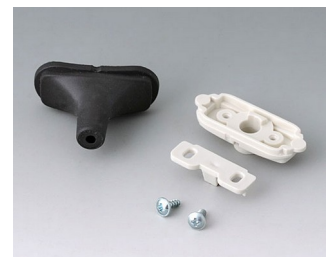
B2911309 Cable gland kit, 3.4 - 4.2 TPE black RAL 9005