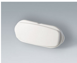
B2811207 End part ASA+PC (UL 94 V-0) off-white RAL 9002