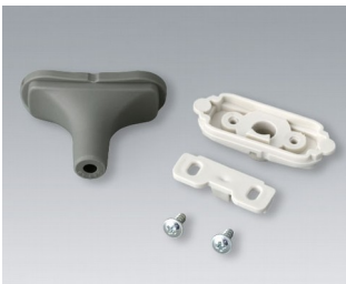
B2911318 Cable gland kit, 4.2 - 5.0 TPE volcano