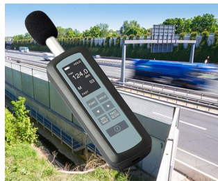
Noise level measurement