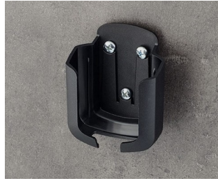
B2931509 Holder M ASA+PC (UL 94 V-0) black RAL 9005