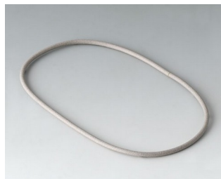
A9502030 Sealing 100