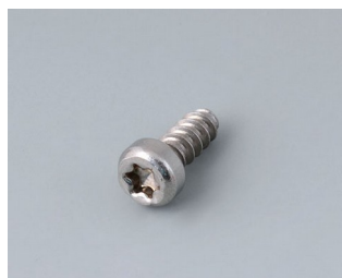
A0325060 Self-tapping screw 2.5 x 6 mm (T8) Stainless steel