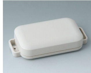
C3206107 EASYTEC 100 ASA+PC (UL 94 V-0) off-white RAL 9002 121x62x26mm IP 65 opt., IP 40