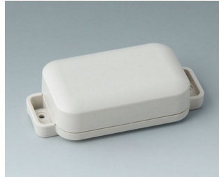
C3204207 EASYTEC 80 ASA+PC (UL 94 V-0) off-white RAL 9002 101x50x26mm IP 65 opt., IP 40