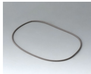
A9503030 Sealing 125