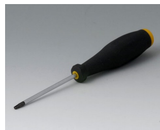
A0399T08 Torx T8 screwdriver