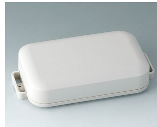
C3208107 EASYTEC 150 ASA+PC (UL 94 V-0) off-white RAL 9002 172x93x36mm IP 65 opt., IP 40