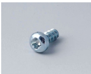
A0305031 Self-tapping screws 2.5 x 6 mm (PZ1)