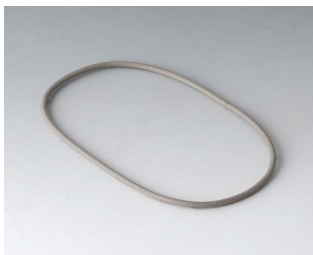
A9500030 Sealing 80