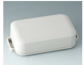
C3208207 EASYTEC 150 ASA+PC (UL 94 V-0) off-white RAL 9002 172x93x46mm IP 65 opt., IP 40