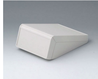
B4054127 UNITEC S, 1.4/0.6 ABS (UL 94 HB) off-white RAL 9002 125x177x69mm IP 40