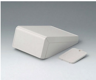
B4054207 UNITEC S, 0.6/0.6 ABS (UL 94 HB) off-white RAL 9002 125x177x69mm IP 40