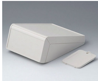
B4056217 UNITEC M, 1.4/1.4 ABS (UL 94 HB) off-white RAL 9002 148x210x80mm IP 40