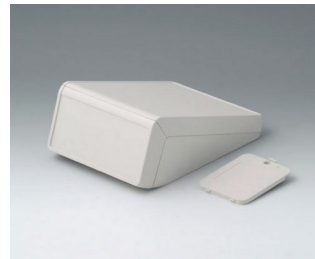
B4054227 UNITEC S, 1.4/0.6 ABS (UL 94 HB) off-white RAL 9002 125x177x69mm IP 40