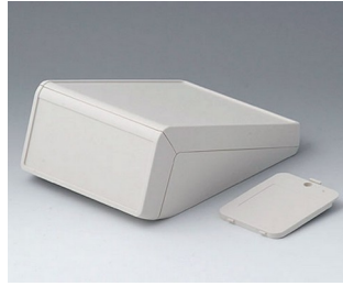
B4056217 UNITEC M, 1.4/1.4 ABS (UL 94 HB) off-white RAL 9002 148x210x80mm IP 40