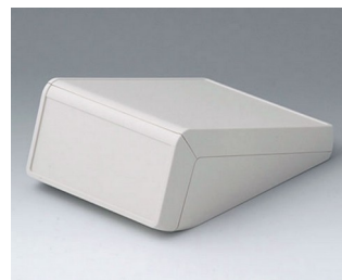
B4056127 UNITEC M, 1.4/0.6 ABS (UL 94 HB) off-white RAL 9002 148x210x80mm IP 40