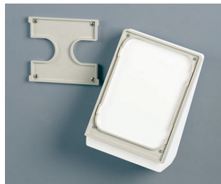
B4156307 Wall suspension element M off-white RAL 9002