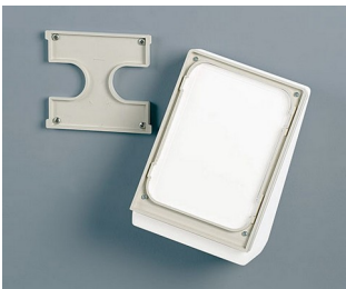
B4154307 Wall suspension element S off-white RAL 9002