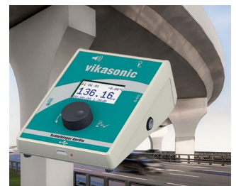
Ultrasonic measuring device