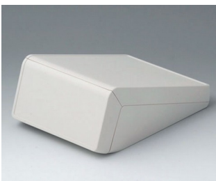
B4056107 UNITEC M, 0.6/0.6 ABS (UL 94 HB) off-white RAL 9002 148x210x80mm IP 40