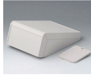
B4056227 UNITEC M, 1.4/0.6 ABS (UL 94 HB) off-white RAL 9002 148x210x80mm IP 40