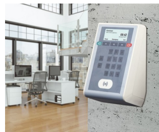
Time recording terminal