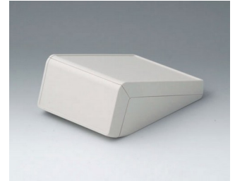
B4054137 UNITEC S, 0.6/1.4 ABS (UL 94 HB) off-white RAL 9002 125x177x69mm IP 40