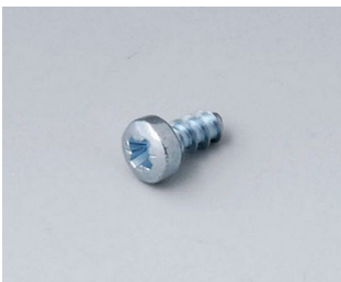
A0306031 Self-tapping screws 3 x 6 mm (PZ1)