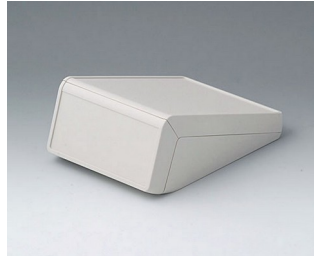
B4054117 UNITEC S, 1.4/1.4 ABS (UL 94 HB) off-white RAL 9002 125x177x69mm IP 40