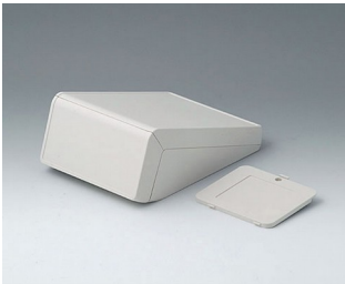
B4054307 UNITEC S, 0.6/0.6 ABS (UL 94 HB) off-white RAL 9002 125x177x69mm IP 40