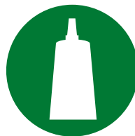
Installation / Assembly of accessories