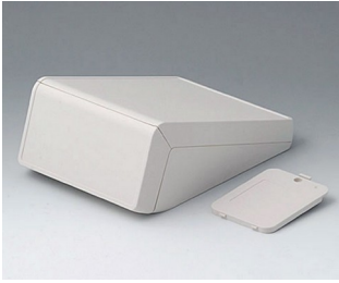
B4056207 UNITEC M, 0.6/0.6 ABS (UL 94 HB) off-white RAL 9002 148x210x80mm IP 40