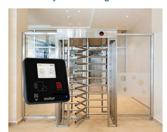
Terminal for access control