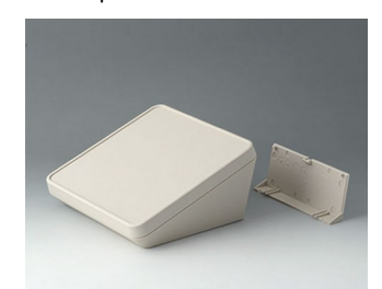
B4418207 PROTEC 180, Vers. II ASA+PC (UL 94 V-0) off-white RAL 9002 180x180x92mm IP 65 opt.