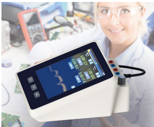
Multimeter measuring device