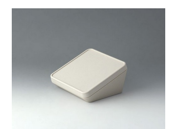
B4414107 PROTEC 140, Vers. I ASA+PC (UL 94 V-0) off-white RAL 9002 140x140x76mm IP 65 opt.