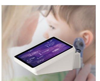
Hearing test device