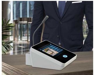
Table microphone / inter phone