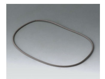
B4514030 Sealing 140