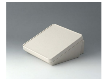
B4418307 PROTEC 180, Vers. III ASA+PC (UL 94 V-0) off-white RAL 9002 180x201x92mm IP 65 opt.