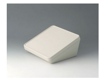
B4418107 PROTEC 180, Vers. I ASA+PC (UL 94 V-0) off-white RAL 9002 180x180x92mm IP 65 opt.