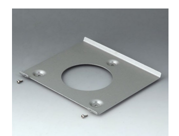
B4522101 Wall suspension element 220 Aluminium