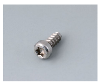
A0325060 Self-tapping screw 2.5 x 6 mm (T8) Stainless steel

Subject to technical modification without notice. © by OKW Gehäusesysteme, Buchen/Germany.