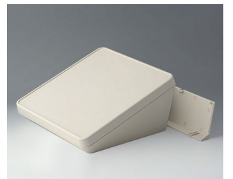
B4422207 PROTEC 220, Vers. II ASA+PC (UL 94 V-0) off-white RAL 9002 220x220x108mm IP 65 opt.