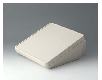
B4422307 PROTEC 220, Vers. III ASA+PC (UL 94 V-0) off-white RAL 9002 220x243x108mm IP 65 opt.