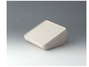
B4414307 PROTEC 140, Vers. III ASA+PC (UL 94 V-0) off-white RAL 9002 140x160x76mm IP 65 opt.