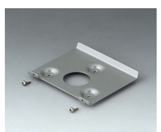
B4514101 Wall suspension element 140 Aluminium