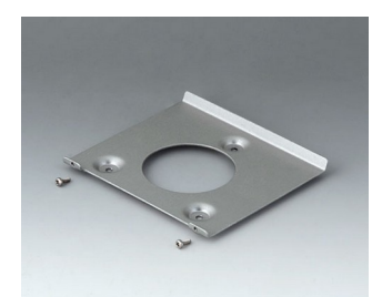
B4518101 Wall suspension element 180 Aluminium