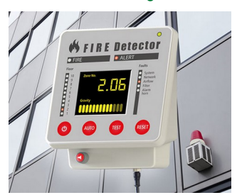
Terminal for fire alarm systems