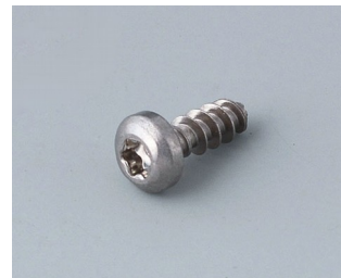
A0308132 Self-tapping screw 3 x 8 mm (T10) Stainless steel

Subject to technical modification without notice. © by OKW Gehäusesysteme, Buchen/Germany.