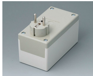
A9021665 PLUG CASE F / D, Vers. I PC+ABS (UL 94 V-0) pebble grey RAL 7032 120x65x65mm