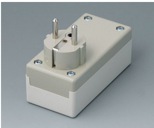
A9011665 PLUG CASE F / D, Vers. I PC+ABS (UL 94 V-0) off-white RAL 9002 100x50x40mm