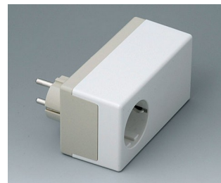
A9022465 PLUG CASE D, Vers. II PC+ABS (UL 94 V-0) pebble grey RAL 7032 120x65x55mm