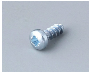
A0308031 Self-tapping screws 3 x 8 mm (PZ1)