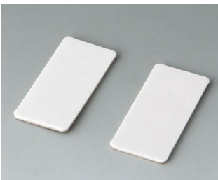
A9305147 Adhesive foil holder

Subject to technical modification without notice. © by OKW Gehäusesysteme, Buchen/Germany.