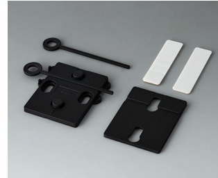
A9305019 Wall suspension elements ASA+PC (UL 94 V-0) black RAL 9005