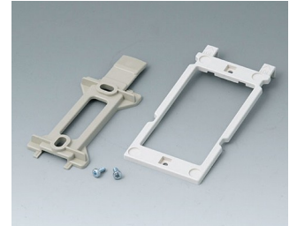
B1350048 Wall suspension elements ABS (UL 94 HB) pebble grey RAL 7032