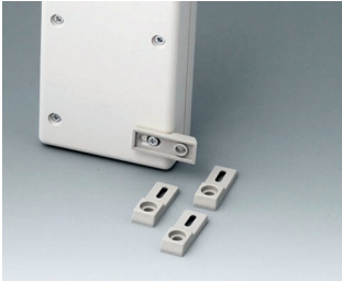
A9204108 Wall mounting brackets PA 6 pebble grey RAL 7032